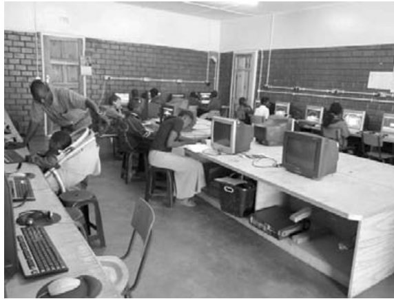
Figure 5.5b. School children use computers and access the Internet in a private Christian school in Macha.

radio transmitter as well as masts and antennas installed by LinkNet to extend the community's Internet infrastructure. Here water and signals transit through the same node. Internet infrastructure is quite literally supported by water infrastructure. The digital economy is layered upon the resource economy. Our research team contributed to this tower archaeology when we installed antennas and a base station to test an experimental mobile phone network called VillageCell, which uses the white space part of the electromagnetic spectrum to provide free local mobile-phone service in Macha. 18 The creation of telecommunication infrastructure, which is often done relatively invisibly by linemen and tower workers in urban and rural areas alike, is a biophysical process that involves assembling and hauling equipment, climbing up and down towers, measuring positions, making adjustments, and performing tests. After numerous challenges, our team finally managed to get VillageCell operating—only to have its base station struck by lightning and out of commission a few months later. Infrastructure development is a process that takes time and involves failure.