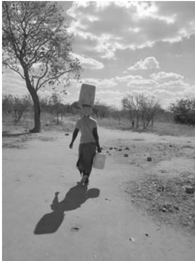
Figure 5.5a. Women's bodies and labor are integral parts of water distribution infrastructure in Macha.