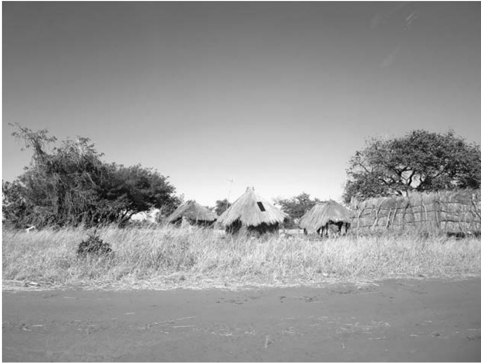
Figure 5.1. Most Machans live in homesteads scattered around the center of this rural Zambian community.

to work closely with community members as part of the process of integrating information and communication technologies (ICTs) in rural areas arises on the heels of other ICT for development (ICTD) projects that have failed because of limited engagement with people who would be using new technologies. 2 Much ICTD work is underpinned by development ideology—a blind faith in the capacities of ICTs to “modernize” and “enhance” the lives of anyone fortunate enough to come within their reach. This development ideology sets the tone for many ICTD projects seeking to address the needs of the so-called “O3B” or “other 3 billion”—the mass of people still without Internet access who are alternately imagined as a technologically disenfranchised class or a giant untapped market. 3 In the context of such logics, many Africans feel their communities have either become test sites for Westerners doing feel-good ICT research or a dumping ground for the West’s digital hand-me-downs—old computers and printers shipped to Africa, many of which are obsolete, broken, or incompatible with local electrical systems, and thus useless. 4 In Macha an entire cargo container sent from Europe and filled with computer equipment sat unused for months. After the container became infested with termites,