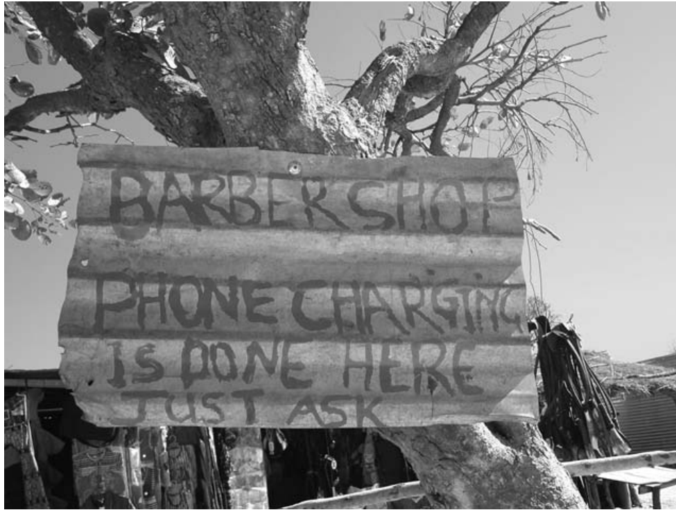
Figure 5.4. This sign appeared at Macha's open-air market, where people from the area come to charge mobile phones and other electronics.

ways of powering their devices and by local autodidacts who have figured out how to repair and maintain them.