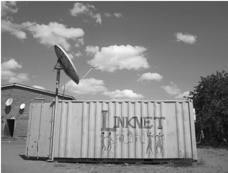
Figure 5.2. Machans could access the Internet from 2011 to 2012 from several LinkNet VSAT terminals built out of repurposed cargo containers.

much of its contents were burned, causing exposure to toxic incineration of plastic and metal parts. Other donated computers have piled up in storage rooms awaiting software installations.