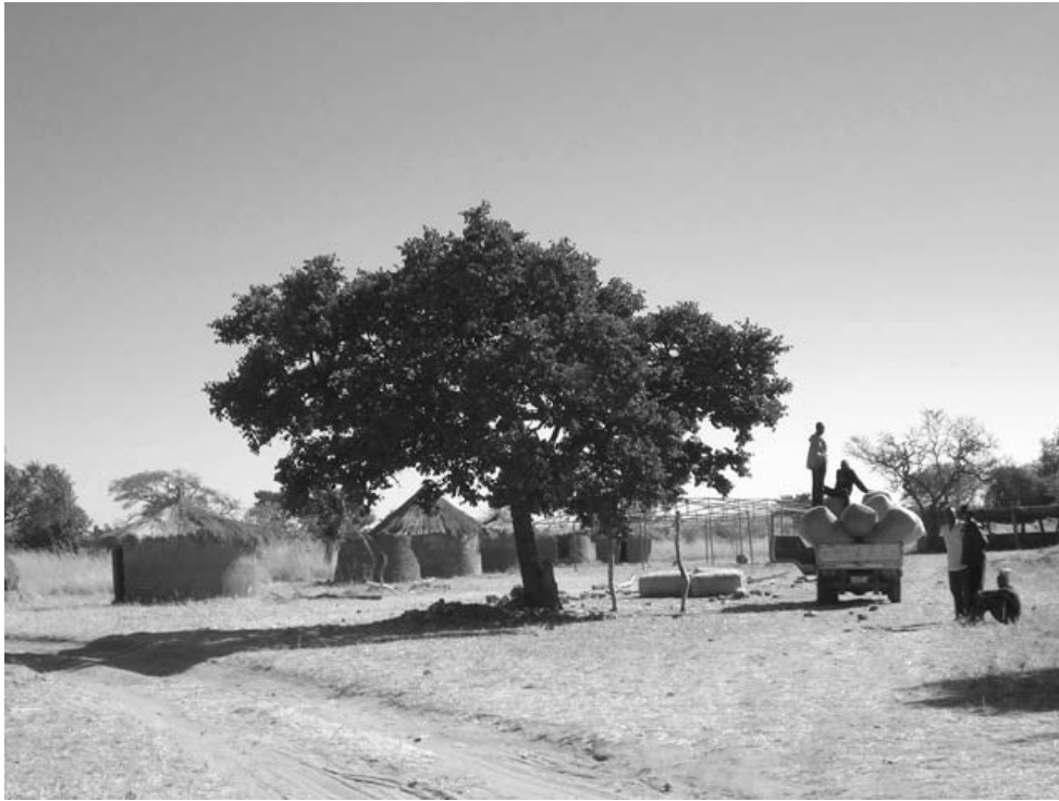
Figure 5.7. Farmers around Macha have created ways of distributing important details about crop prices via Internet, radio, and mobile phone as they move around their farms.

and will highlight the reality that many Machans live without ever accessing the Internet and may not want it at all.