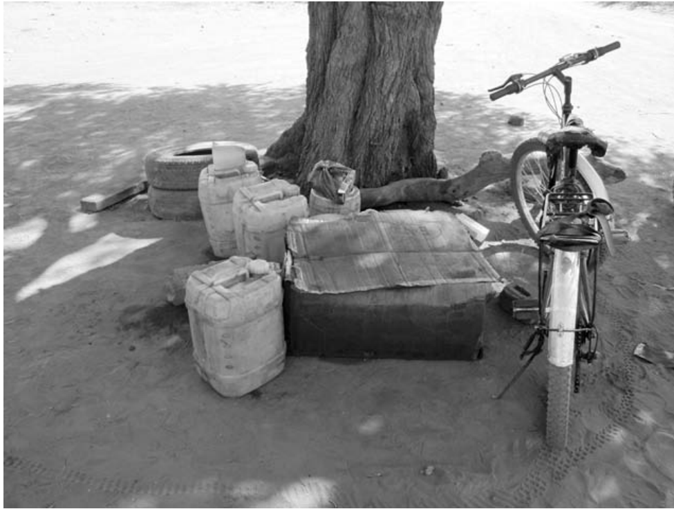
Figure 5.8. This small gas station in Macha supports a growing number of used Japanese cars, which Machans have purchased online in recent years.

(see figure 5.8) in front of Macha's Blue Sky market that stays open until supplies run out, usually for a few hours. Gas is transported from Choma in large plastic tubs and sold on the side of the road in plastic bottles for 12.50 kwachas ($2.40) a liter. Thus as Internet access facilitates a sense of participation in the global economy, it alters local resource demands and modes of mobility such that humans, bicycles, oxen, dogs, and chickens now share the same dirt roads with Toyotas.