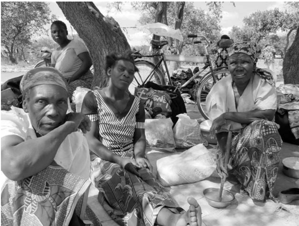
Figures 5.9a and 5.9b. Many women we interviewed at the fire camps near Macha's hospital indicated they have neither heard of nor used the Internet and expressed disinterest in it.