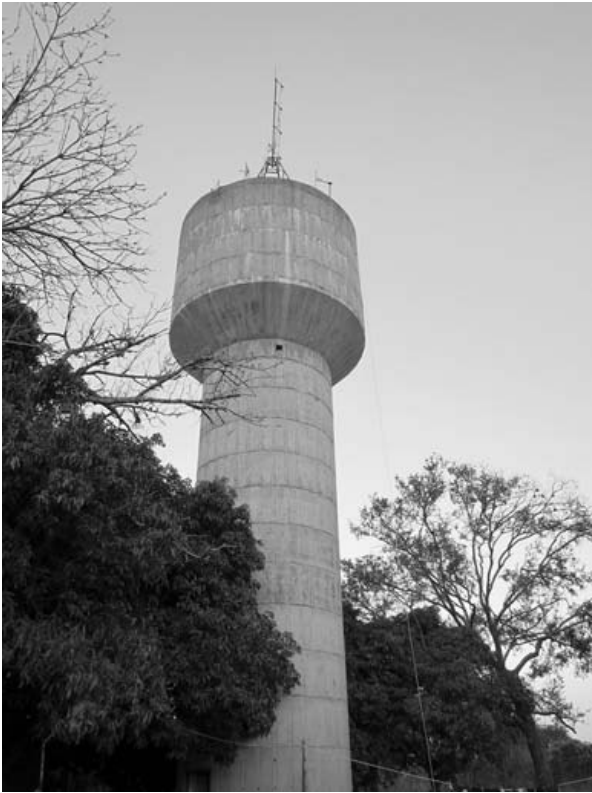
Figure 5.6. Macha's water tower hosts several antennas and was one of the sites of our team's VillageCell experiment.

up via satellite to servers thousands of miles away in Silicon Valley and then back down the satellite link through servers in Macha. As already mentioned, the community and its Dutch supporters were paying up to seven thousand dollars per month for the capacity to route data intended for local exchange through servers on other continents. 19 If this were not enough, the satellite Internet gateway experienced latency, slow speeds due to limited bandwidth, and frequent downtimes because of power outages. The technical portion of our research thus involved designing systems to support local control of data exchange and reduce cost, congestion, and Internet downtime. 20 Because of high gateway fees, it is five times more expensive for Zambians to access the Internet in rural areas than in urban areas. 21 In an effort to help alleviate high gateway costs, in 2011 AfriConnect provided a microwave Internet link in Macha, reducing LinkNet's monthly expense to four thousand dollars, which still proved too costly. The completion of a ten-thousand-kilometer transoceanic cable between Sudan and South Africa, called EASSy (which cost $263 million),